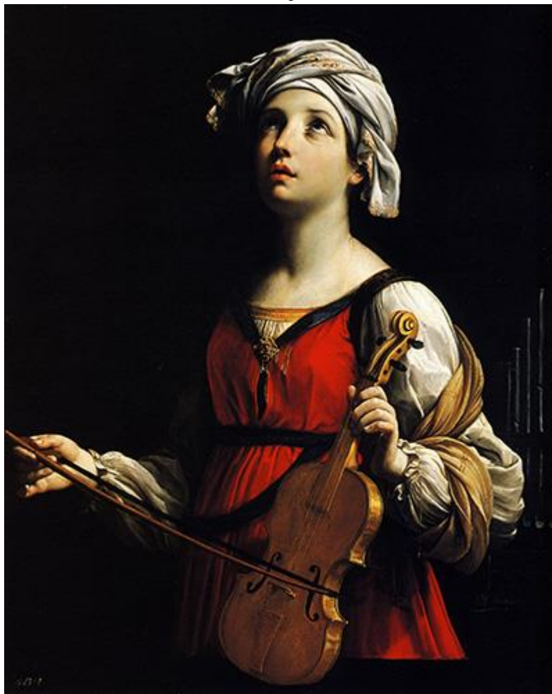
St Cecilia, Guido Reni, Date: 1606

Saint of the Month – St. Cecilia – Feast day November 22 nd