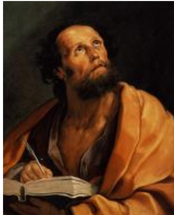
Saint Luke, Guido Reni, 1621

St. Luke's two-volume work comprises the third Gospel and the Acts of the Apostles. His Gospel is the only one written by a Gentile Christian and it is likely that he wrote it between 70 and 85 AD. Luke was thorough in his research and interviewed eyewitnesses when composing his works. Luke's writing is warm and his Gospel is often summarised as the Gospel of Mercy.